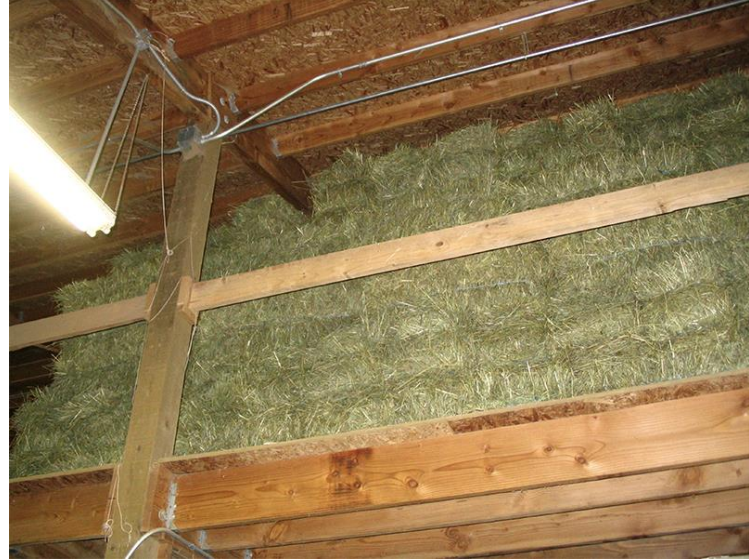
Tightly stacked bales of hay in a loft with minimal ventilation is a textbook fire hazard in a barn.