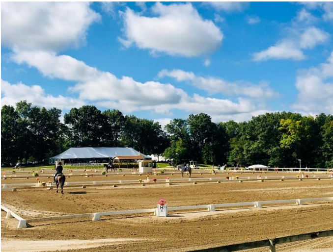
A beautiful day for showing at Regional Championships at the Waterloo Hunt Club.

In September the Waterloo Hunt Club and HorseShowOffice.com hosted the Region 2 Championships. These championships hosted horses and riders from all over the area and showcased just how well respected and capable Kevin Bradbury and his staff are. While Waterloo is no stranger to hosting large horse shows, Regionals invite the best of the best and there is no room for error. Because this show tends to be much larger than the typical shows that HorseShowOffice.com hosts, extra tents were brought in not just for stabling, but for entertainment and vendors. The show ran over five days and required an ample supply of staff and volunteers.