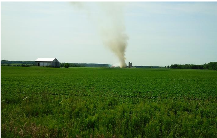
Most barns are located in rural areas and lack fire detection devices, so when a fire starts it can go undetected for a long time. Barn fires spread quickly because barns are designed for ventilation, which makes for a quick and powerful fire path.

Oxygen – The nature of farm buildings is that they were designed, for the most part, to allow ventilation and air circulation. While that is great for barn occupants, it certainly doesn't help when it comes to preventing or extinguishing a fire. Often, installed fire separation walls are compromised with the installation of wiring, plumbing, and other utility systems.