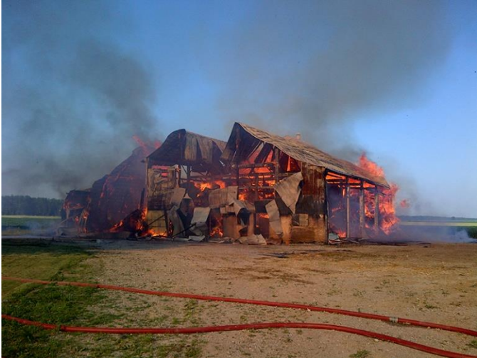
Hay and straw should be properly dried before storing in the barn to reduce the risk of spontaneous combustion.

Oxygen – The nature of farm buildings is that they were designed, for the most part, to allow ventilation and air circulation. While that is great for barn occupants, it certainly doesn't help when it comes to preventing or extinguishing a fire. Often, installed fire separation walls are compromised with the installation of wiring, plumbing, and other utility systems.