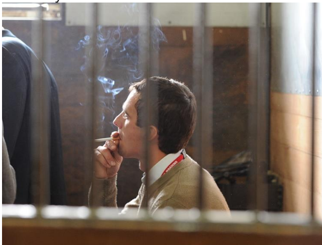
A no smoking policy should be strictly enforced in the barn and near all flammable materials.