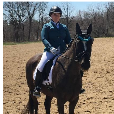
Myself and Maleficent (Fin) at our first show together.

No...really... look out, as in find a safe place to hide. The Goddess of Armageddon is coming!